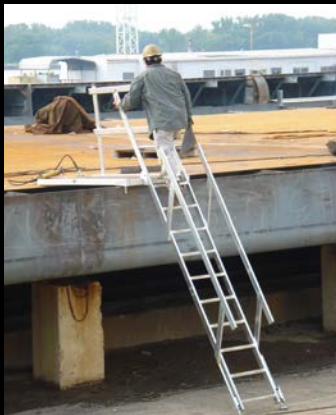
Access Ladder with Handrails