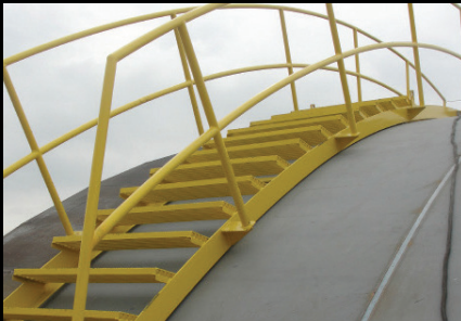
Barge Welding Arch