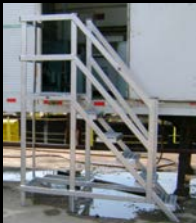
Work Platform Ladder