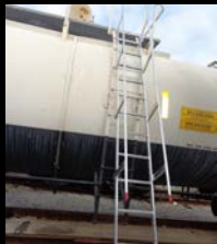
Rail Car Access Ladder