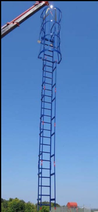
Access Ladder with Handrails

Visit our website to explore additional custom built products created for all your needs. www.iascustom.com/custom-gallery