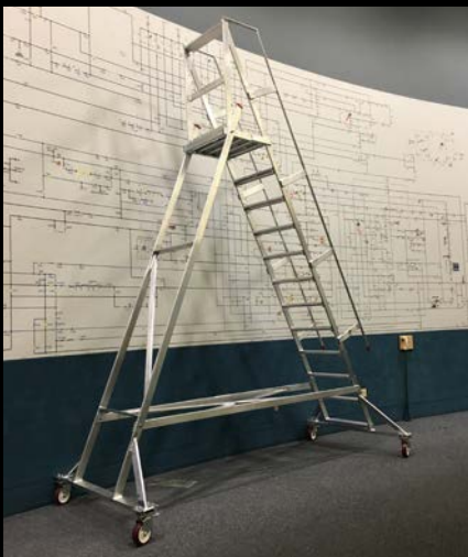
Collapsible Platform Ladder